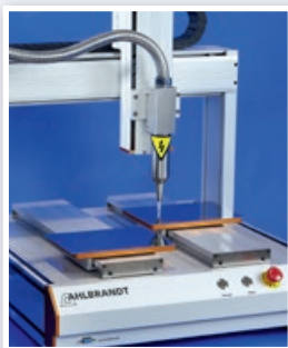
Nozzle with xy-table