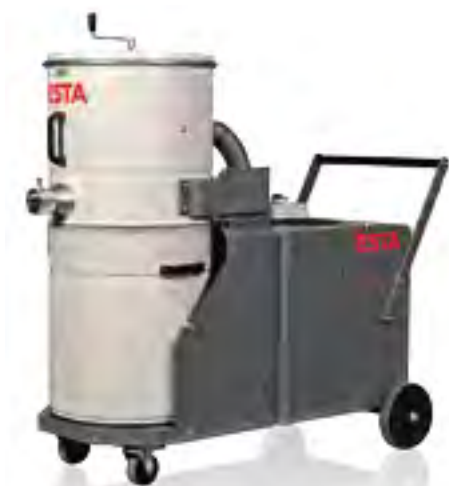
High vacuum WHISPERSOG