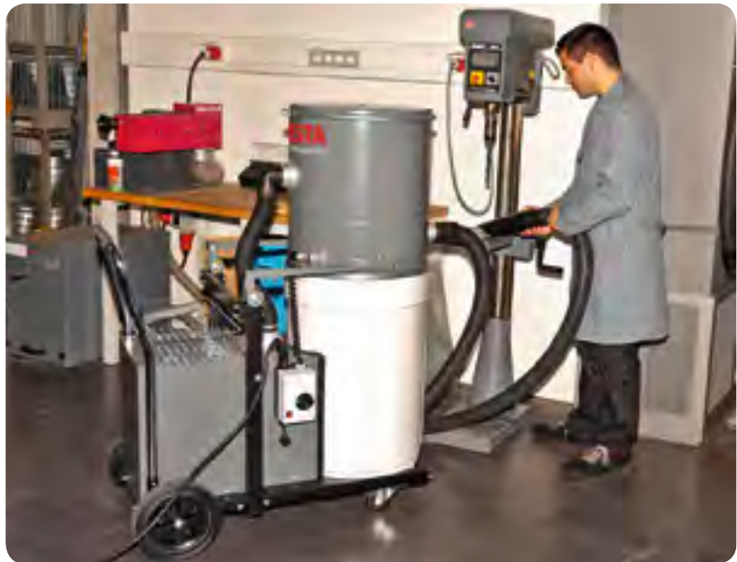
SPÄNESOG-S cleaning a drill