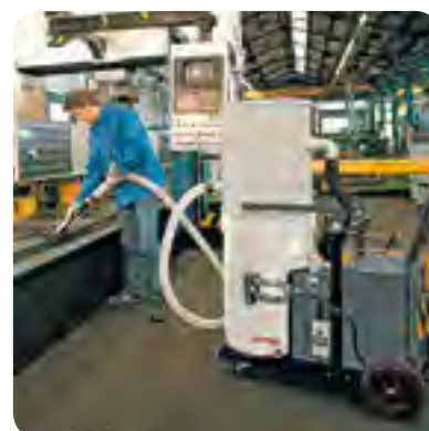
Removal of brass shavings and coolants at a CNC milling station