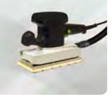
Connecting of hand-held machines